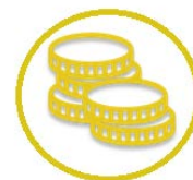
Reimbursement of one annual professional subscription/registration