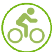
Cycle to work scheme