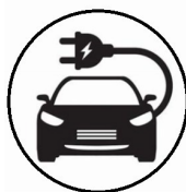
Electric vehicle salary sacrifice