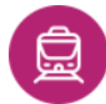
Discounted travel passes