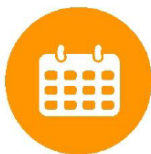
Buying and selling annual leave

Find out more about our full range of staff benefits .