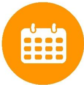
Buying and selling annual leave

We want to offer staff the most competitive benefits for working with us. We already benefit from our surroundings with six green flag recognised parks, extensive woodlands, excellent transport connections and a newly regenerated town centre, however all staff can make the most of the following: